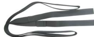
MAIN BRIDLE-STD (Spring loaded pilot chute) P/N: 021-006-004