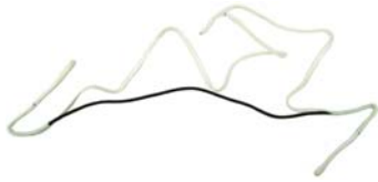
RECOIL RIPCORD P/N: 032-017-005