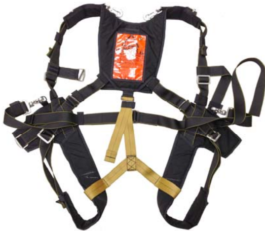
STUDENT HARNESS P/N: 043-001-001