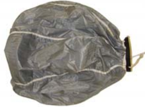
RESERVE PILOT CHUTE P/N: 022-001-000