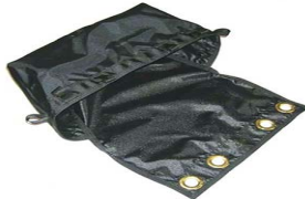
MAIN DEPLOYMENT BAG* Various options available