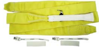
54" DETACHABLE LOWER BRIDLE P/N: 032-014-001 60" DETACHABLE LOWER BRIDLE P/N: 032-014-002