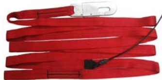
STATATIC LINE P/N:035-001-001