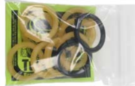
TANDEM TUBE STOWS P/N: TUBESTOWS-T