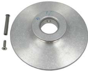
SIGMA DISC ASSEMBLY P/N: 032-017-018