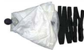
MAIN PILOT CHUTE* Various sizes & options available