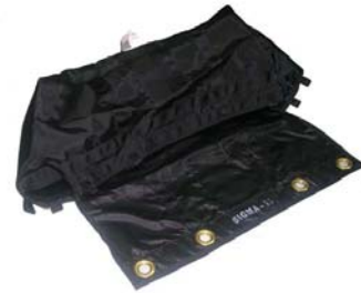
MAIN DEPLOYMENT BAG – SIGMA 13 P/N: 026-002-001 MAIN DEPLOYMENT BAG – SIGMA 12 P/N: 026-002-002