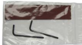
DROGUE DISC TOOL KIT P/N: N/A