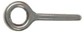
RECOIL RIPCORD PIN P/N: MIS-H-MAIN PIN