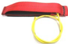
LEFT OPEN BOC HANDLE P/N: 033-005-003