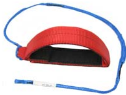
SPECTRA RESERVE RIPCORD 24.5" P/N: 024-021-001