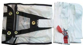
RESERVE DEPLOYMENT BAG*