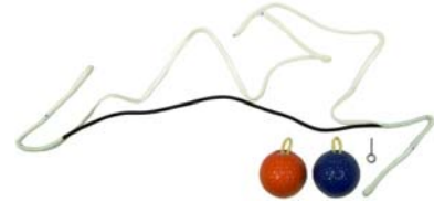
RECOIL RIPCORD- COMPLETE ASSEMBLY P/N: 032-017-006