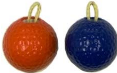
ORANGE DROGUE RELEASE HANDLE P/N: 032-017-008 BLUE DROGUE RELEASE HANDLE P/N: 032-017-008