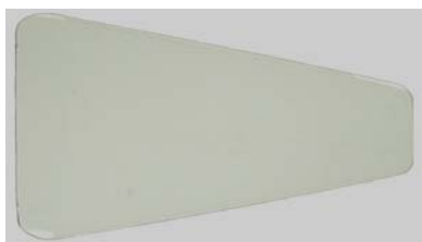
RESERVE PIN FLAP LEXAN WINDOW P/N: 008-006-015