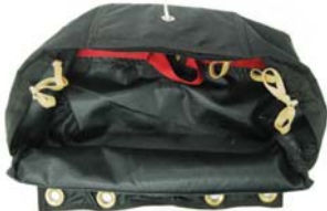
MAIN DEPLOYMENT BAG* Various options available