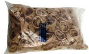
TANDEM RUBBER BANDS P/N: ELAST-RUB-TAND