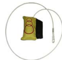
PILLOW RESERVE HANDLE*