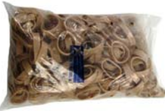
RUBBER BANDS P/N: SPORTBANDS