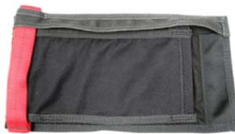
LEFT OPEN BOC POUCH P/N: 020-004-001