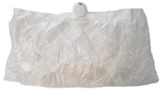
54" DROGUE (WHITE) P/N: 032-001-001 60" DROGUE (WHITE) P/N: 032-001-003