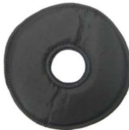
SIGMA DISC COVER P/N: 032-017-001