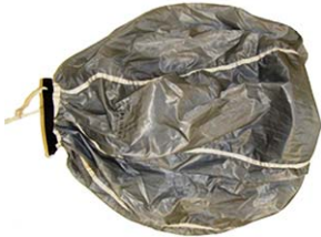
RESERVE PILOT CHUTE P/N: 022-001-000