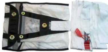
RESERVE DEPLOYMENT BAG-SIGMA 13 P/N: 027-002-018 RESERVE DEPLOYMENT BAG-SIGMA 12 P/N: 027-002-019