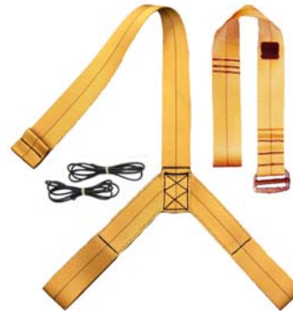
STUDENT HARNESS Y STRAP P/N: 043-001-005