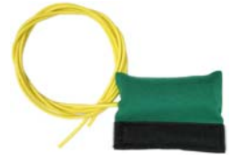
CUTAWAY HANDLE P/N: 023-002-001