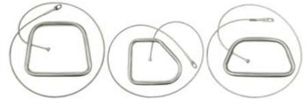
METAL RESERVE RIPCORD* Available as Standard D, Mini D or Low Profile D handles. RSL & Non-RSL