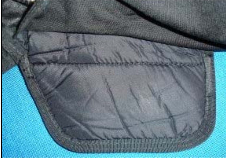
Under side view of yoke flap.